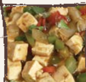
153 Ma Po Beancurd