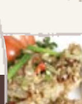
18 Soft Shell Crab