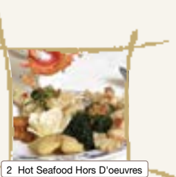
2 Hot Seafood Hors D'oeuvres