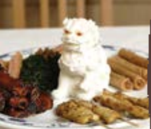
1 House Hot Hors D'oeuvres