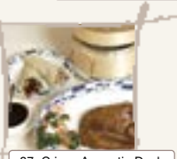
87 Crispy Aromatic Duck