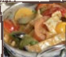
151 Thai Chicken Curry