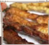
3 Grilled House Satay