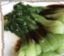
167 Stir-Fried Seasonal Chinese Vegetables