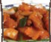
139 Sweet & Sour Chicken "Hong Kong Style"