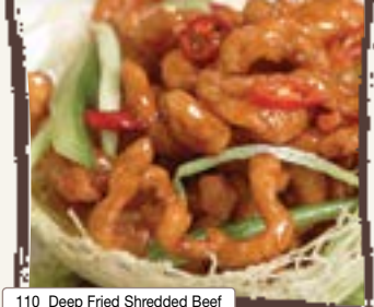
110 Deep Fried Shredded Beef with Chilli