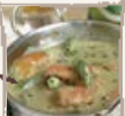
152 Thai Green Prawn Curry