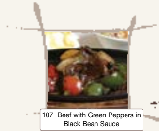
107 Beef with Green Peppers in Black Bean Sauce