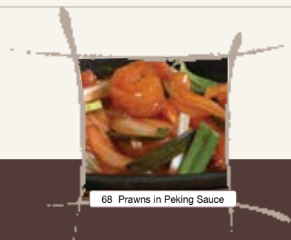
68 Prawns in Peking Sauce