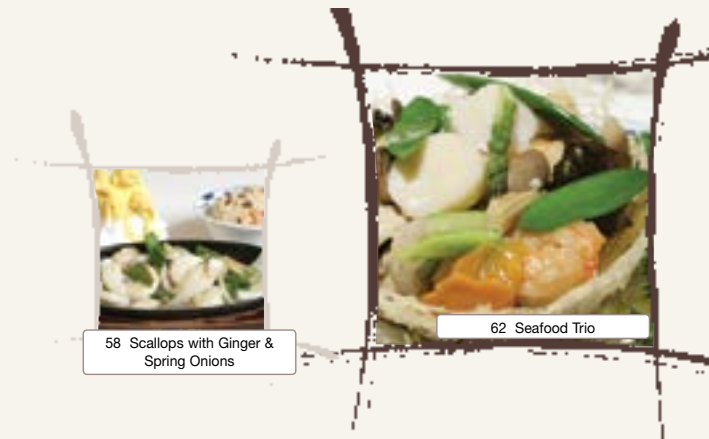
58 Scallops with Ginger & Spring Onions